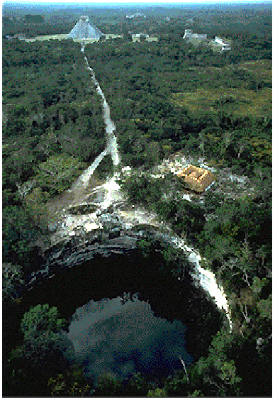
OJeffrey Jay Foxox / NYC

It is important to understand that the seasons mark life cycles of the landscape and of people. In Brazil, we can cite, for example, the great droughts of the semi arid northeastern region that do not occur annually but follow greater cycles, remain for months and can be forecasted through meteorological instruments. It is known that the great droughts return every 12 to 14 years and remain for two to three years. The biggest droughts registered in Brazil's Northeast occurred in 1724, 1877, 1984 e 1998 [5]. It is supposed that the process through which an area becomes a desert can be caused by large-scale deforestation that is caused by the construction of cities.