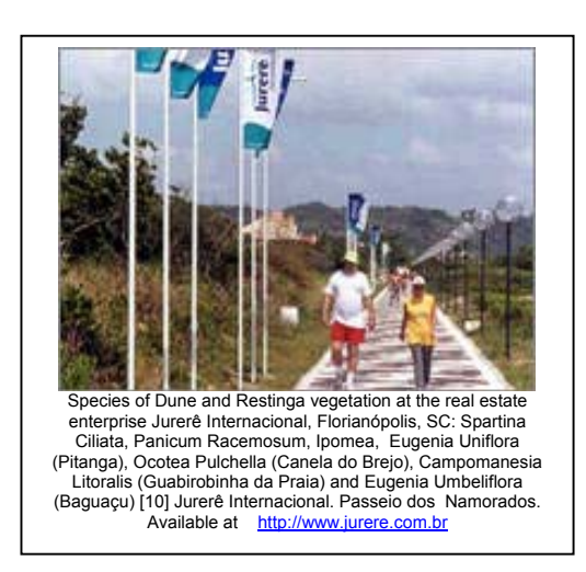
Figure 5: Jurerê Internacional [22]

2.5.3 Mata Atlântica (Rain Forest of the Atlantic Slope).